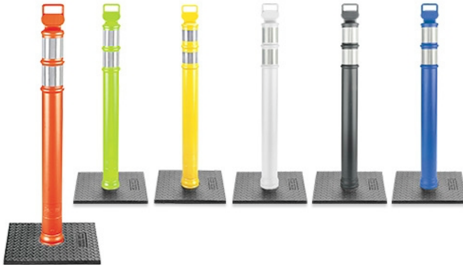
Figure 2. Representative fixed post obstacles.

Images or diagrams of obstacles used within the ASC are provided in Figure 2. These obstacles include the fixed posts and the moving obstacle. These images are representative of the kind of obstacles that ASC Teams should expect, and these can be utilized for design and development of the snowplow vehicle and its navigation, guidance, and control system for obstacle avoidance.